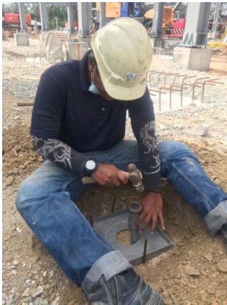
FIELD DENSITY TEST (FDT)