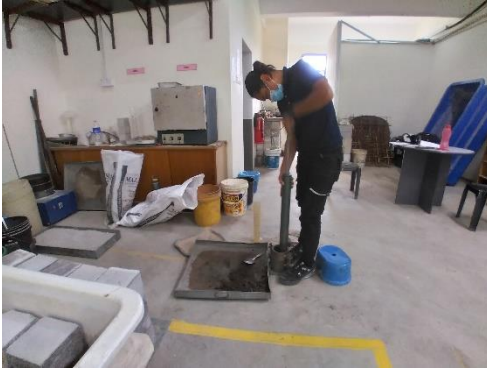
SOIL COMPACTION TEST