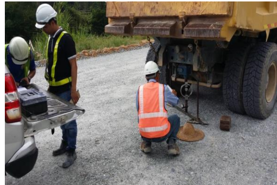
CALIFORNIA BEARING RATIO TEST