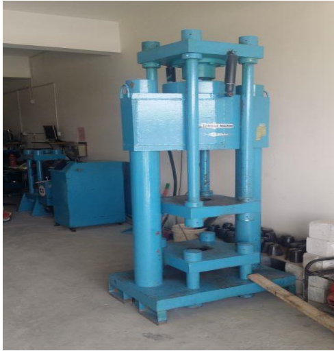
Steel bar tensile and elongation test