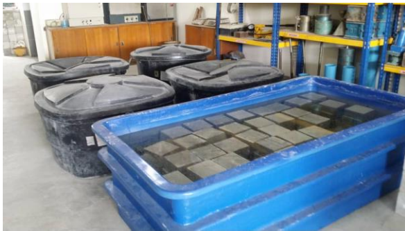
CUBE SPECIMENS CURING FACILITY