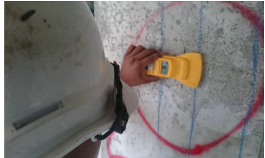
COVER METTER TO SCAN STEEL BAR POSITION