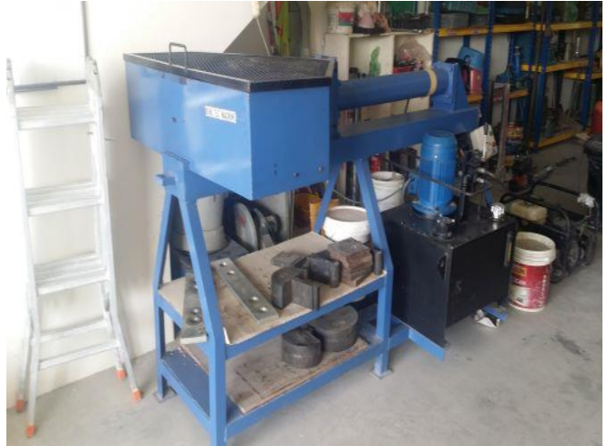
Steel bar bend & rebend test