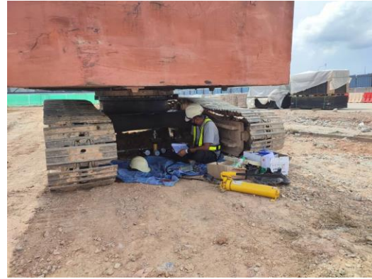
PLATE BEARING TEST