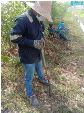
MACKINTOSH PROBE TEST